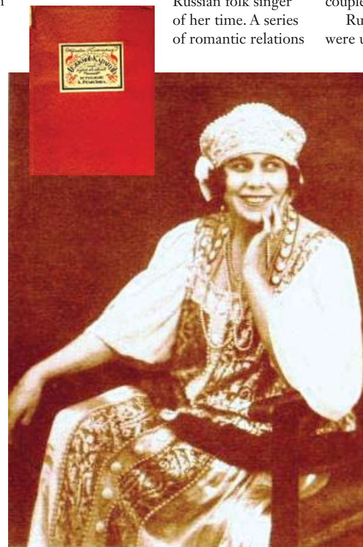
Cover for the book “Nadezhda’s Round Dance”. Portrait of Nadezhda Plevitskaia in a Russian folk costume.

This fascinating book is available in Ellis Library Special Collections.