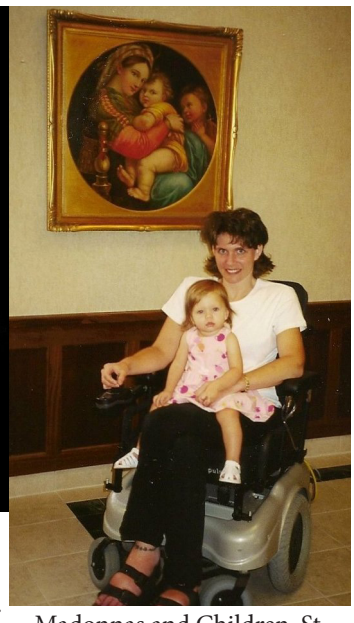
Madonnas and Children, St. Joseph the Workman Cathedral, La Crosse, WI ca. 2005