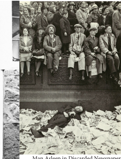
Man Asleep in Discarded Newspapers Beneath Crowd on Embankment, Coronation Parade Route for King George VI, London, England, ca. 1936, by Henri Cartier-Bresseon, Courtesy of HC-B.