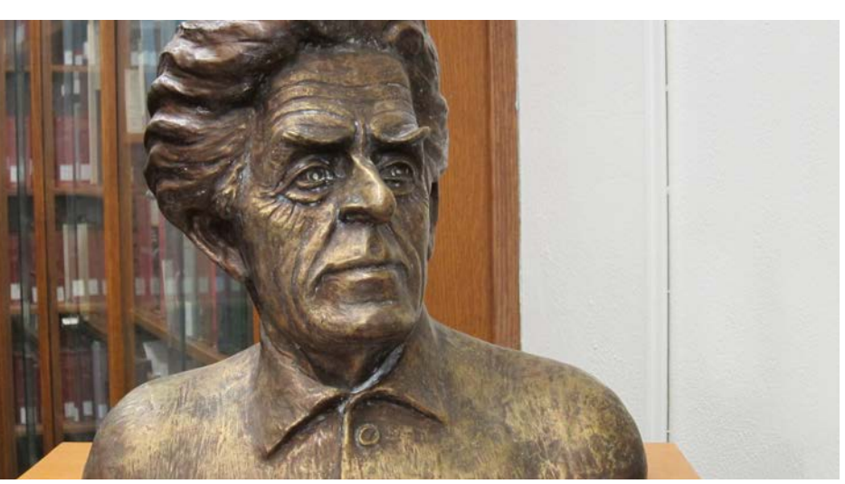
Do you know where this picture was taken in the MU Libraries? Find the answer at the bottom of Page 7.