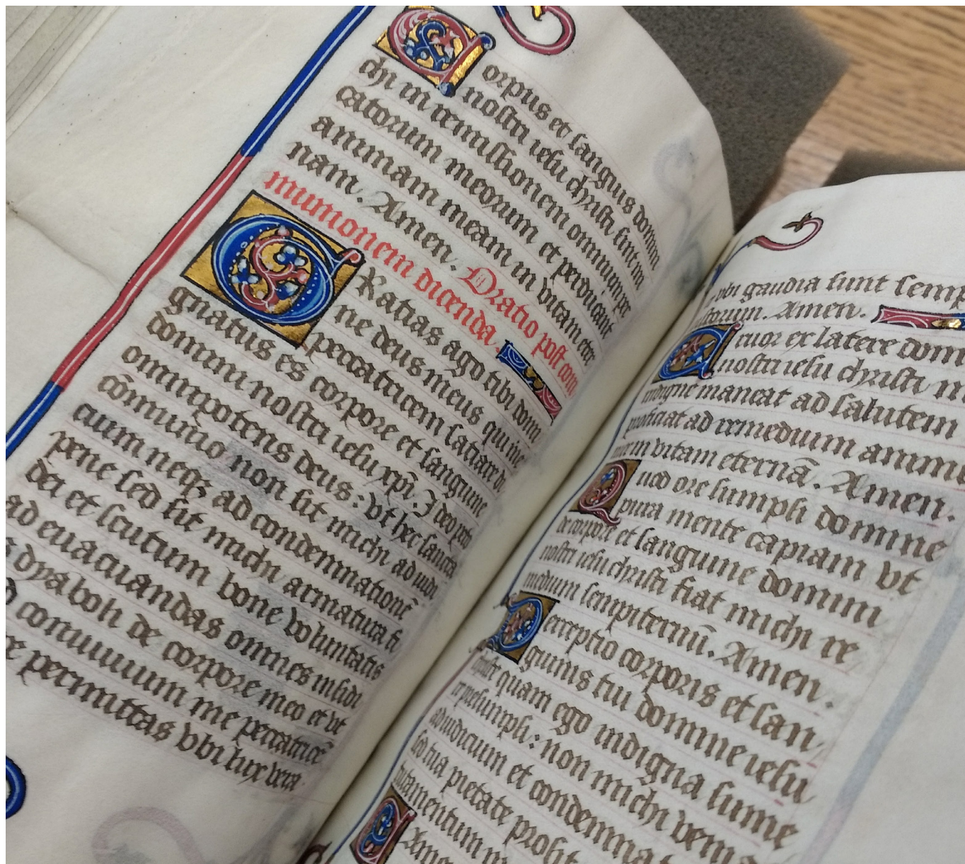
Illuminated prayers from a processional for the use of the Dominican sisters of St. Louis, Poissy, ca. 1510, Rare Vault BX2032 .A2 1510