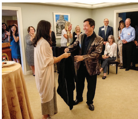
A sequined surprise! The Magic Jacket