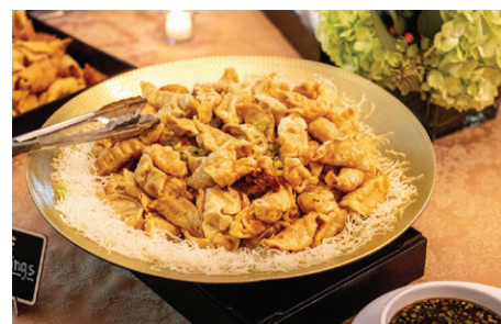
Thank you to Jina Yoo's Asian Bistro!