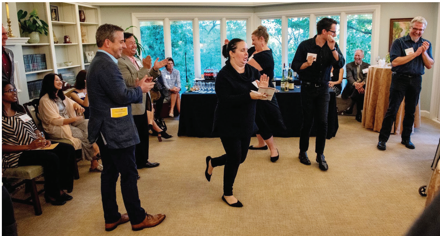
The Stable Boys (and girls!) kept the crowd laughing.