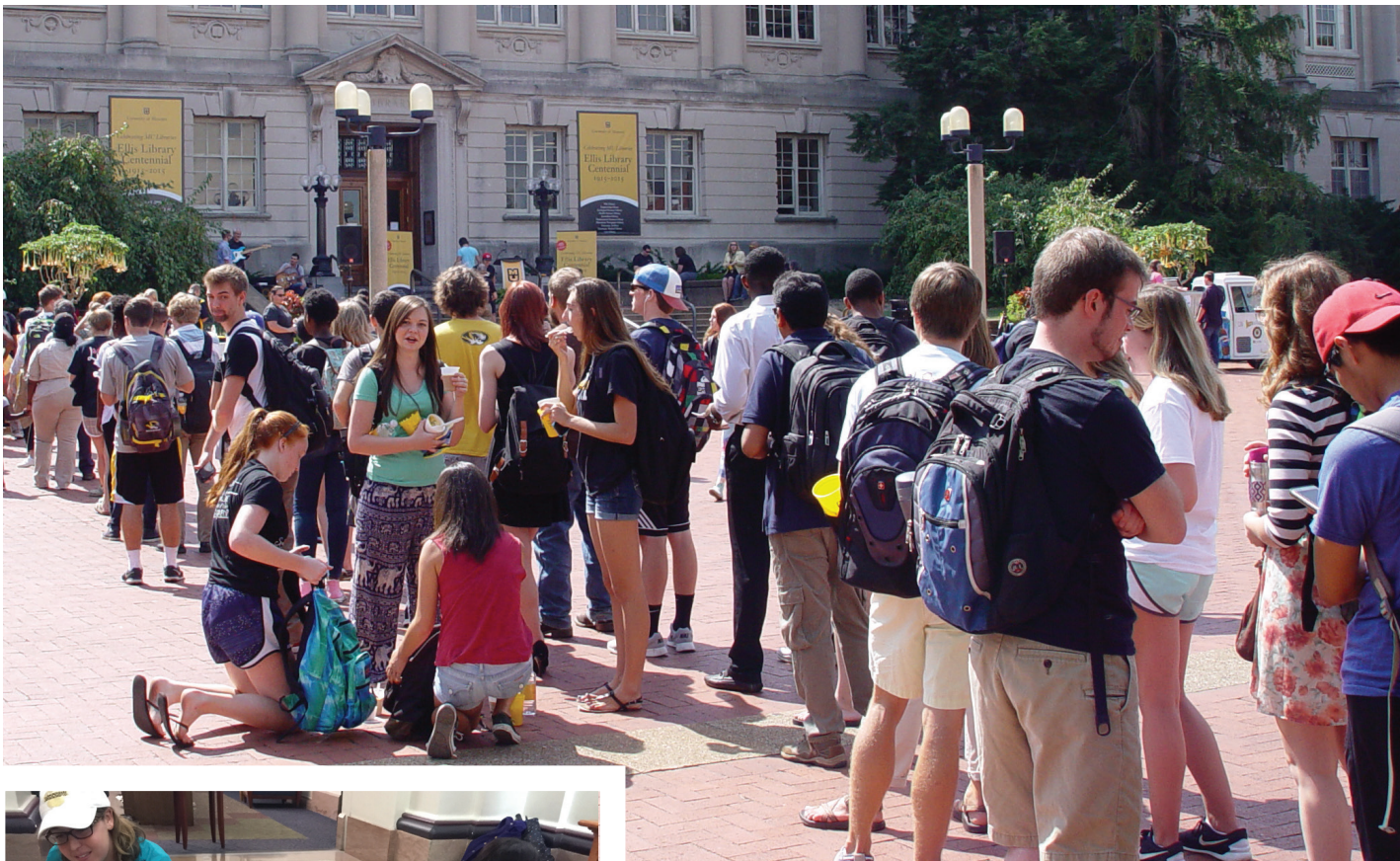
▲ Students line up for pizza outside of Ellis Library during the Centennial Kickoff on Aug. 23.