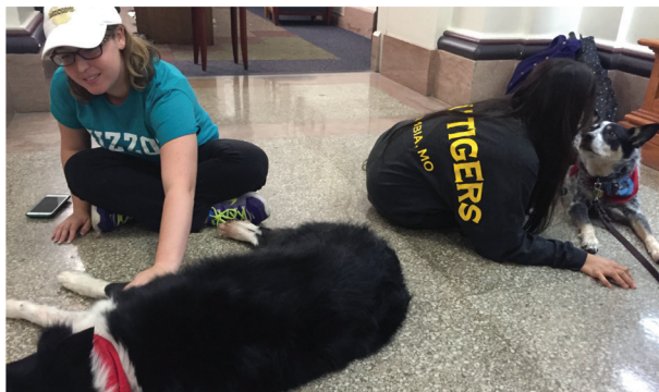
▲ Therapy dogs provide comfort to students during finals week.