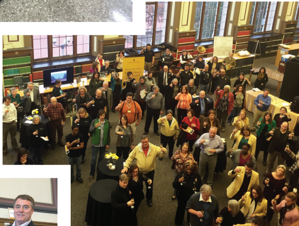
► Attendees at the Ellis Library Centennial Rededication on February 15 toast to the next 100 years of the MU Libraries.