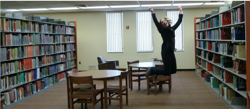
Do you know where in the MU Libraries this picture was taken? Find the answer on Page 6.

APRIL 15, 2016 Library Society Dinner 6 to 9 p.m. Ellis Library Grand Reading Room