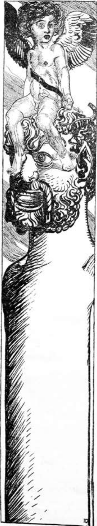
Das Recht des Stärkeren. I. Die.