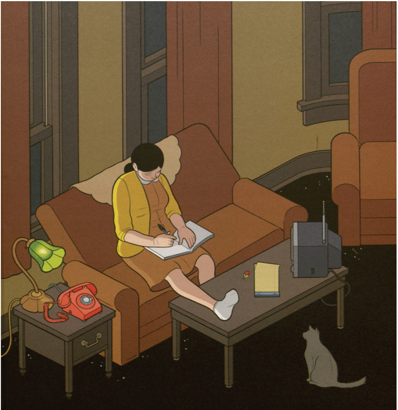
Special Collections | Building Stories, Chris Ware | PN6728.8 .P36 W37 2012