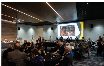
Our audience members engaged in the program in the beautiful space at the State Historical Society of Missouri.