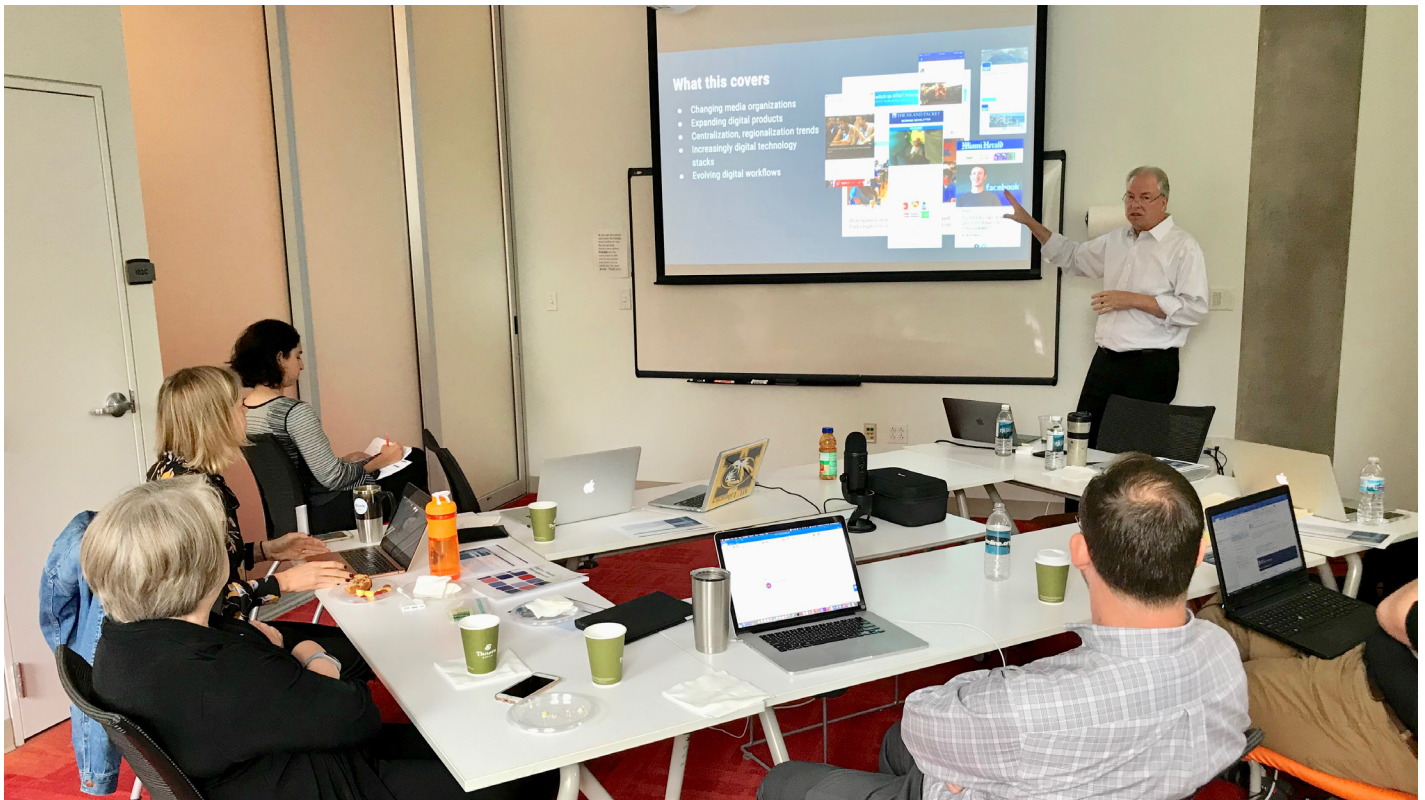
During a year long project, the Memory Hole team from the Journalism Digital News Archive, a joint initiative of RJLI and University Libraries, plans to visit news outlets across the U.S. and Europe.