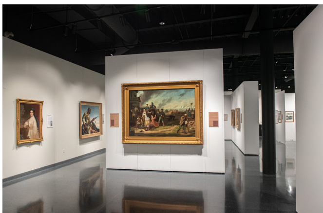
A snapshot of the wonderful art gallery