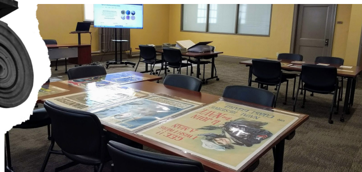
A newly renovated classroom allows Special Collections to share their resources with a variety of MU classes.

We are proud to announce this year's campaign total was: