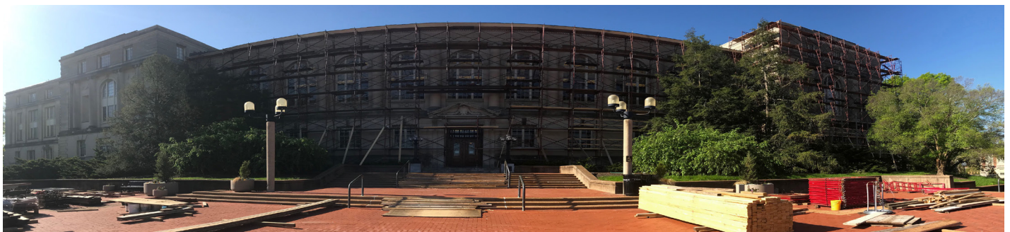
Many of the historical windows in Ellis Library are being replaced or renovated this spring. The project, which is expected to cost over $2 million, impacts the original 1914 building and the 1935 addition.

On March 12, the first fence was put up at UMLD, marking the beginning of construction. The expansion is scheduled for completion on February 1, 2021.