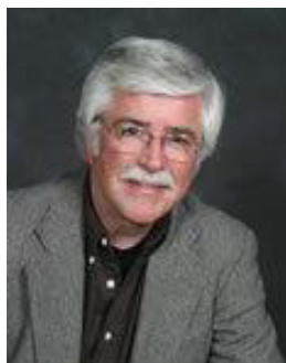
William Trogdon, known to his loyal readers as William Least Heat-Moon, has just released his tenth book, O America.

Also lost to the schedule reshuffle of 2020 was recognizing Mr. William Trogdon as a Golden Quill Award winner. In May of 2006, the Jesse Hall Notable Alumni Wall was dedicated, and in 2017, the Jefferson Club Board of Trustees refreshed the criteria for consideration and gave the recognition a new name —the Jefferson Club Golden Quill Alumni Excellence Award. Honorees demonstrate outstanding achievement in their chosen field and reflect the university's core values of respect, responsibility, discovery and excellence. If you know William, please reach out with a congratulations!