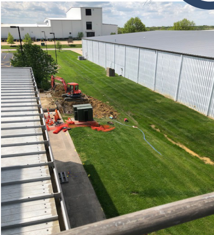
Installation of utility lines for the expansion of the University of Missouri Libraries Depository began in May.

The University of Missouri Libraries Depository (UMLD) is an off-campus storage facility, established in 1997, for important but infrequently used materials. Currently UMLD is at max capacity, housing over 1 million items. The Libraries rent space for around 400,000 additional materials, but another approximate 600,000 items need to be transferred from the campus libraries. To accommodate these materials, the UM Board of Curators approved an expansion of UMLD.