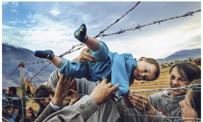
POY 57 Global News: Award of Excellence

Standing on the sea floor, a diver is approached by a right whale in 2008. Over 15-meters in length and weighing 70 tons, this whale had most likely never seen a human before and was highly curious.