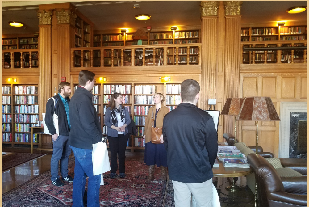
Representatives from the University Libraries Advisory Council visit a reading room in the Doe Library at University of California in Berkeley in January.