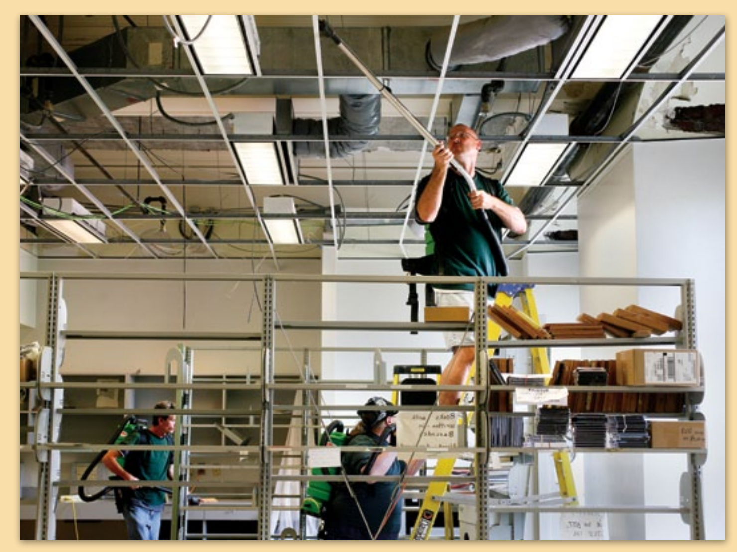
Workers clean the celing in the circulation area.

To view video of the damage in government documents, visit www.youtube.com/user/MUGovDocs.