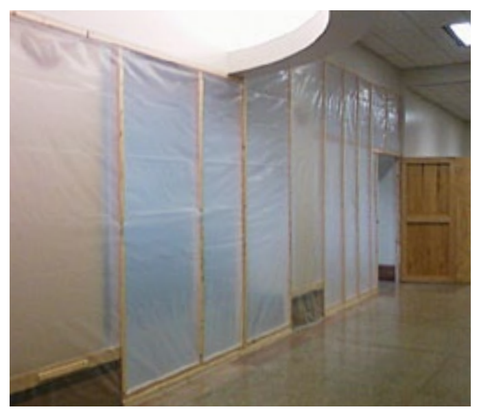
Dividers were erected around the circulation, reserve and interlibrary loan offices, which is where the fires were set.