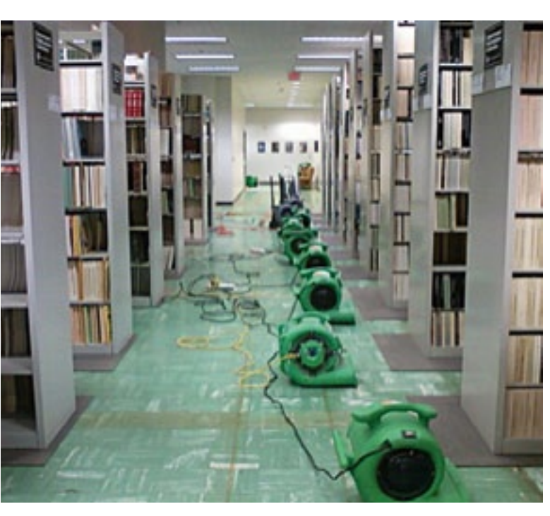
Industrial fans were set up throughout the northeast quadrant of Ellis Library's main floor.