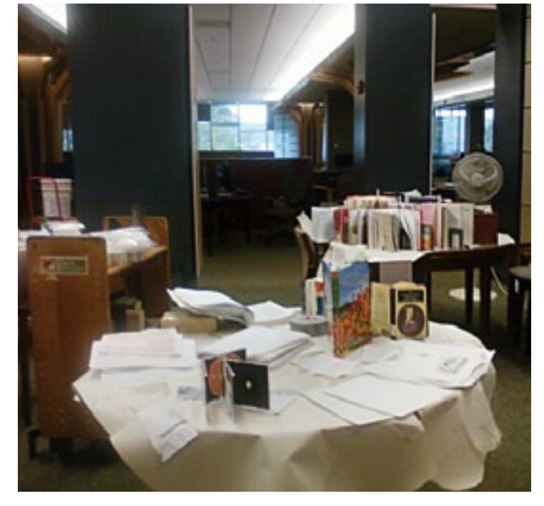
Library materials had to air out after being soaked by sprinklers.