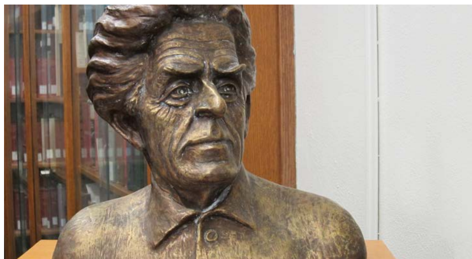
Do you know where this picture was taken in the MU Libraries? Find the answer at the bottom of Page 7.