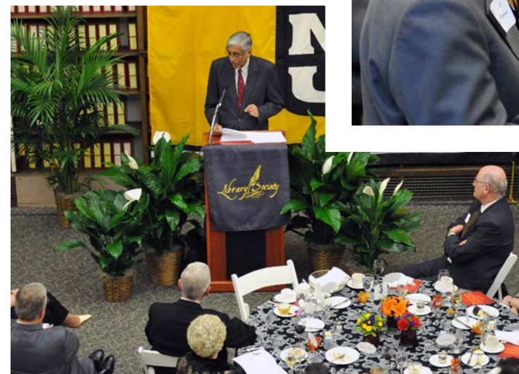
Rajmohan Gandhi, grandson of Mahatma Gandhi, was the guest speaker at the Library Society dinner April 12.