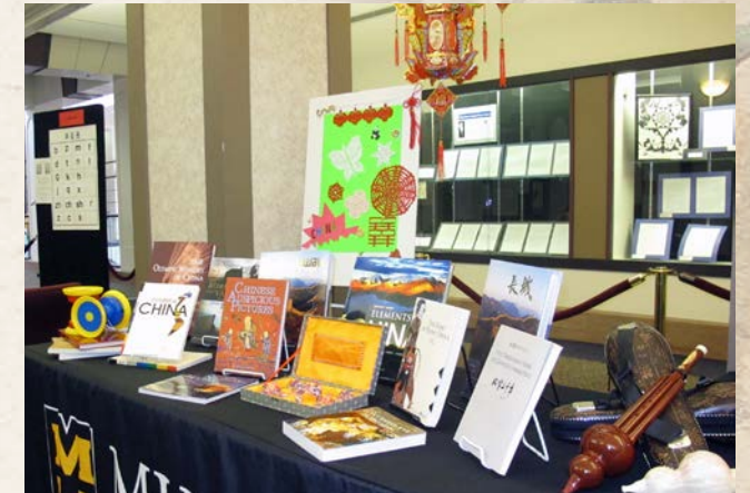
Shanghai Normal University, the Chinese government and the Office of Chinese Language Council donated 1,000 rare and modern Chinese books to MU.

Reprinted with permission from MIZZOU magazine.